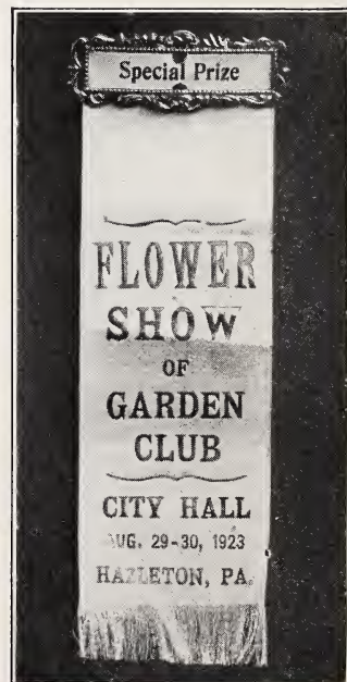
Special Ribbon Flower Show of Garden Club Hazleton, Pa., 1923